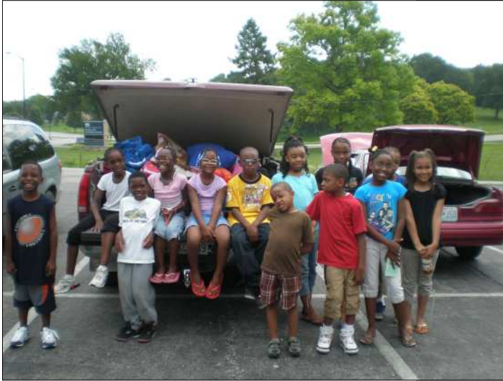
Thirteen campers from the first session needed a ride to camp. We loaded them in our cars to get them here. There was just enough room for everyone.