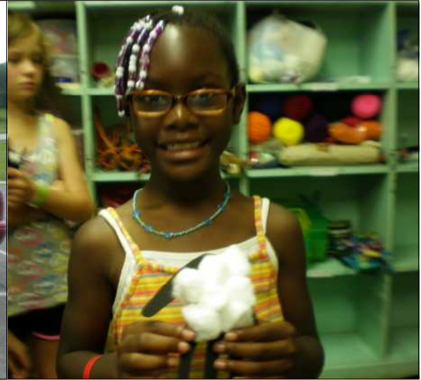
The 6 to 9 year olds were making lambs in crafts to remind them that we are redeemed by the blood of the Lamb - JESUS!