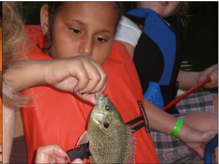
The newest edition to the camp program is fishing. After stocking the new lake last Spring, the fish are growing big and are fun to catch.