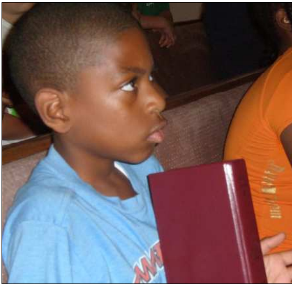
Campers listened during Bible Class - 6 sessions for the week. There were also 12 after meal and before bed time devotions and 3 memory verses.